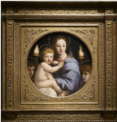
Praying for Peace at Advent

For unto us a child is born, unto us a son is given: and the government shall be upon his shoulder: and his name shall be called Wonderful, Counsellor, The mighty God, The everlasting Father, The Prince of Peace.